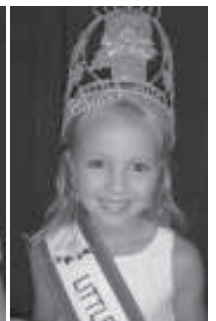
LONDON OLDHAM LITTLE MISS