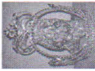
STATE Crown for Kids

_____ $65 Entry Fee (Required) _____ $10 Overall Package (Optional) _____ Total Due