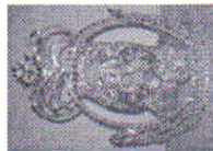
STATE Crown for Kids

_____ $65 Entry Fee (Required) _____ $10 Overall Awards Package _____ Total Due