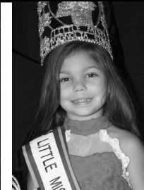
BRISTOL WEST LITTLE MISS