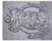
STATE Crown for Kids

_____ $65 Entry Fee (Required) _____ $15 Overall Package (Optional) _____ Total Due DEADLINE TO ENTER IS April 9, 2012